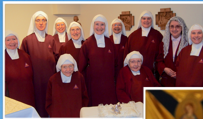
We were again graced to host the Silver Rose on its pilgrimage across the US, Canada, and Mexico