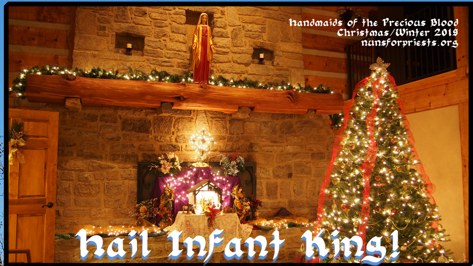
handmaids of the Precious Blood Christmas/Winter 2019 nansforpriests.org