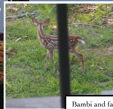
Bambi and family were frequent visitors.