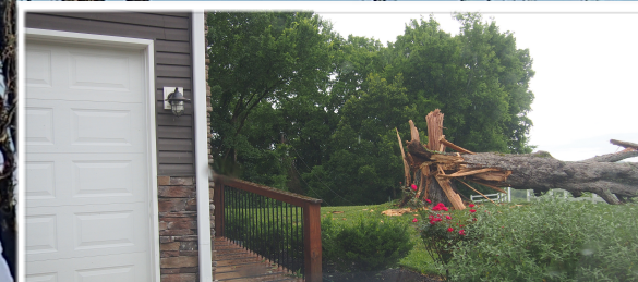
God's Providence: Derecho (wind storm) damage didn't land on the house!