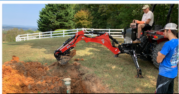
The grass is always greener over the well head leak. FINALLY located during the drought!