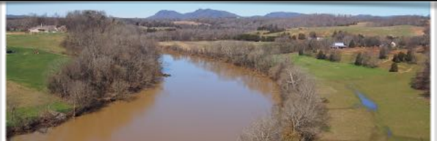
A very muddy Holston river after record breaking February rains