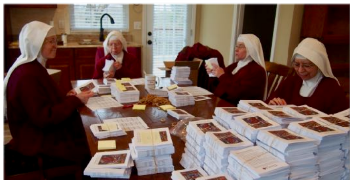
Mailing out the Lenten Novena for Priests for the Knights of Columbus