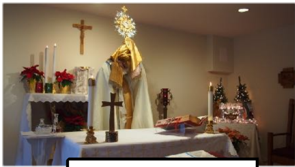
Benediction at Christmas