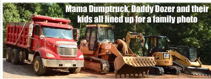
Mama Dumptruck, Daddy Dozer and their kids all lined up for a family photo