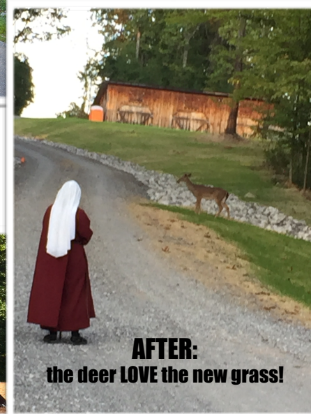
AFTER: the deer LOVE the new grass!