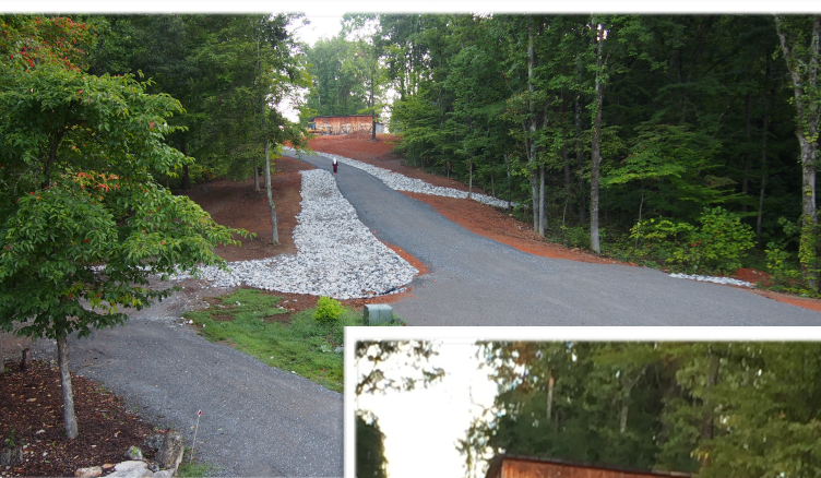
The New Road