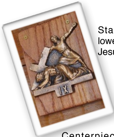
Stations on the lower porch of Cor Jesu.