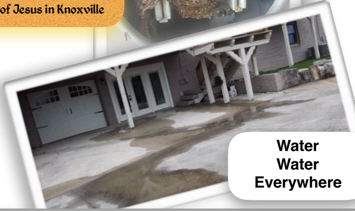
Water Water Everywhere

As workers labored to finish the new Knoxville Cathedral of the Most Sacred Heart of Jesus, we added our prayers and offered up any troubles we might experience in the way of our own maintenance and repairs at our Monastery. Indeed, we had many opportunities to “offer it up” as we suddenly faced water outages, a leaking well, electrical mysteries, industrial strength fumigation for cluster flies, running a new water line, and finding a snake (yes, a snake!) in our electric meter.