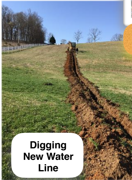
Digging New Water Line