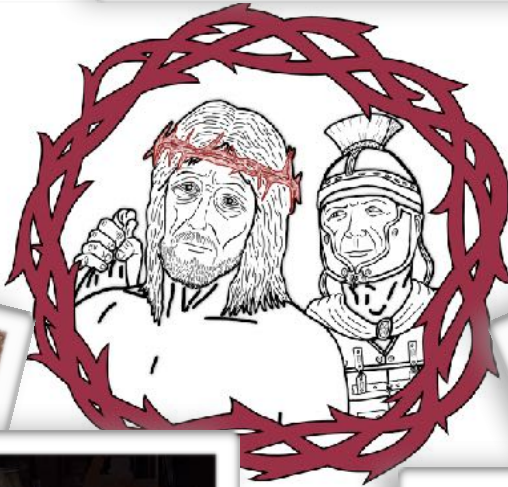
Centerpiece for outdoor Stations under construction