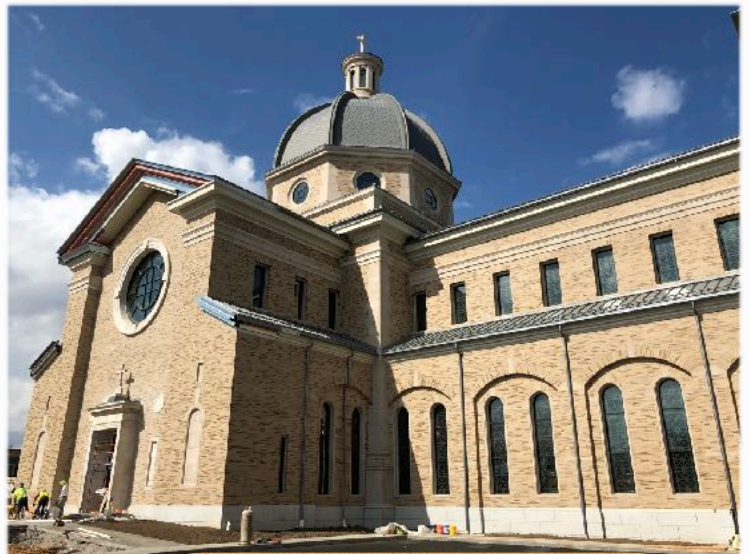
Exterior of the Cathedral shortly before its Dedication on March 3rd, 2018

Perhaps God accepted our gift of little inconveniences, as the Cathedral was finished on time and is beautiful and gorgeous! What a blessing it is for Knoxville!