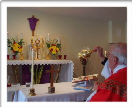
Palm Sunday Benediction