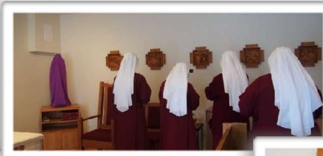
Italian set added to Mass Chapel. Sisters praying Stations during Holy Week.