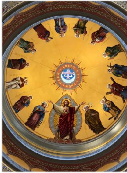
Interior Dome of the Cathedral of the Most Sacred Heart of Jesus in Knoxville