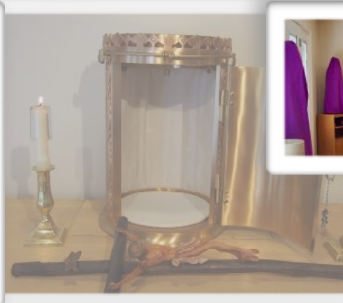
Empty Tabernacle on Good Friday