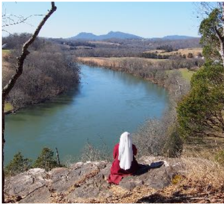
A favorite look-out that keeps its beauty and serenity all year round