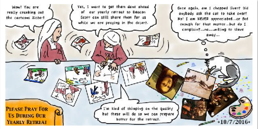
Comic relief provided by our four legged furry feline!

COR JESU MONASTERY 596 CALLAWAY RIDGE NEW MARKET, TN 37820