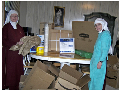
It's moving time again! Here are two of our very best packers! Many thanks to all who supplied the materials and helped in any way.

"Meeting the Lord gets us moving, urges us to leave aside self-absorption...Christian life is defined by verbs of movement. Even when it is lived in the context of the monastery or contemplative cloister it is a life of continual searching."