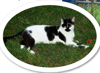
Feeding time at our temporary home in Englewood where 3 Sisters are living until we can all be together in New Market, TN.